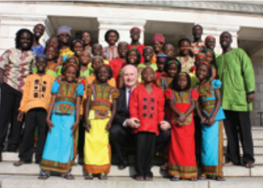
Watoto African Youth Choir