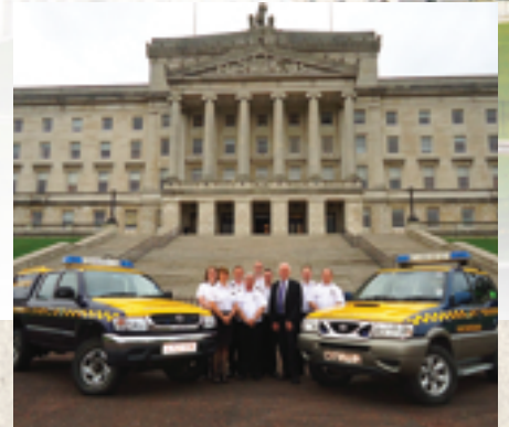
Bangor Coastguard Rescue Team